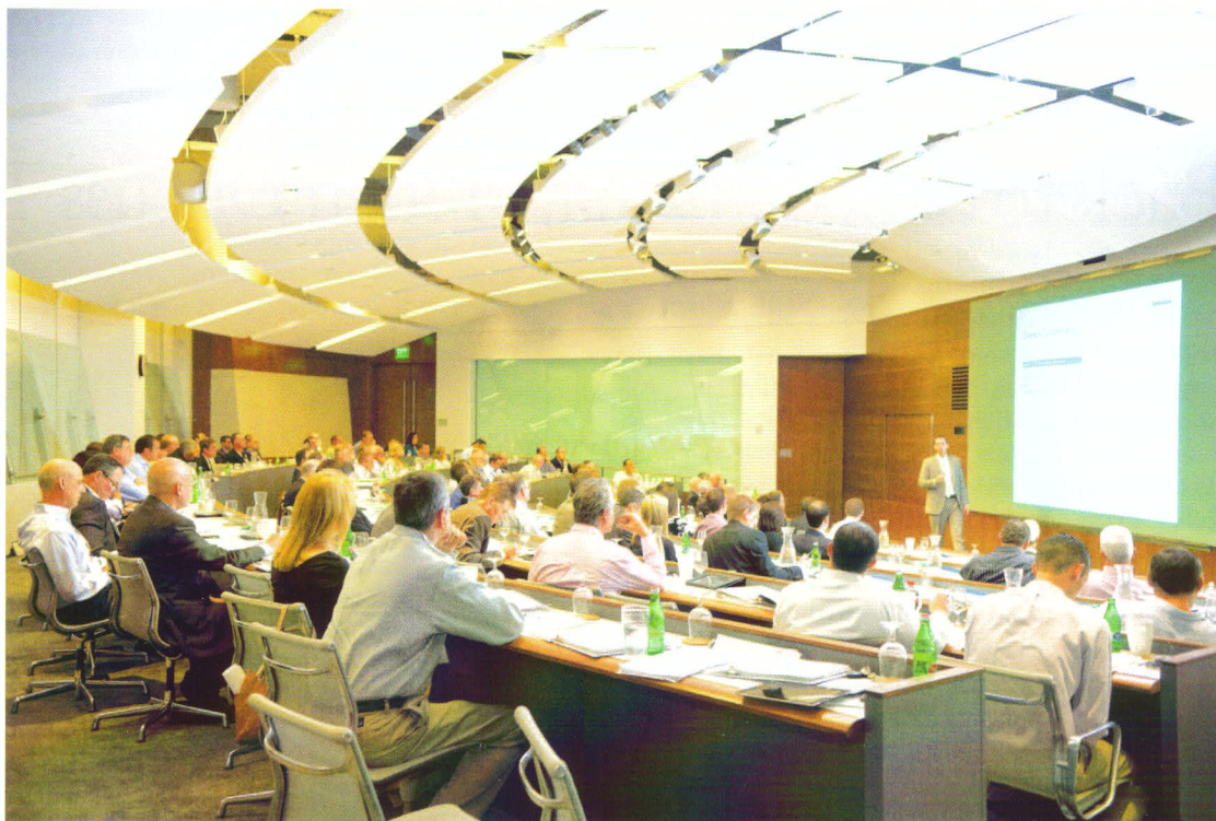
More than 100 advisors came to Dimensional's Austin, Texas, headquarters for two days of seminars.

Advisors selling DFA funds have monthly or quarterly meetings with one another, facilitated by a DFA manager, to discuss portfolio and practice manage-