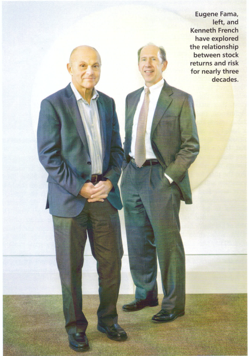
Eugene Fama, left, and Kenneth French have explored the relationship between stock returns and risk for nearly three decades.

The basics of market efficiency are often misunderstood. Some say that if factors such as a stock's value, size, trading momentum, and profitability—all of which are part of your multifactor model—indicate outperformance, then the market isn't really efficient.